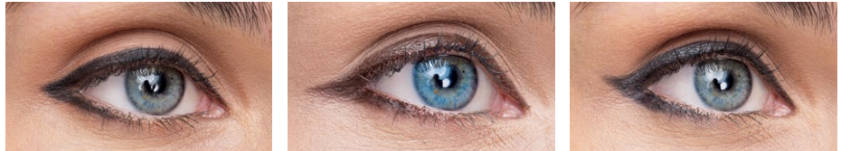
Black (13140) Brown (13141) Charcoal (13142)

$25 each 30% OFF Intense Waterproof Eye Pencil 1.2g $38 RRP