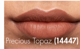
Precious Topaz (14447)