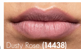
Dusty Rose (14438)