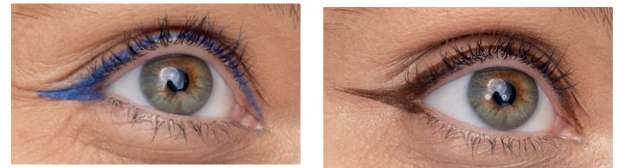
Blue (13153) Brown (13151)