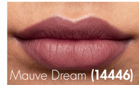
Mauve Dream (14446)