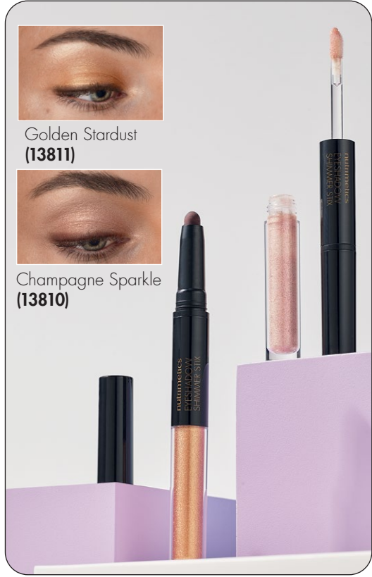
Golden Stardust (13811)