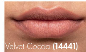
Velvet Cocoa (14441)