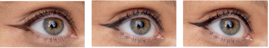
Bronze (13154) Charcoal (13152) Black (13150)