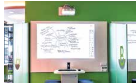
Epson projection in Essex University's “pods”

New technologies – and the evolving digital