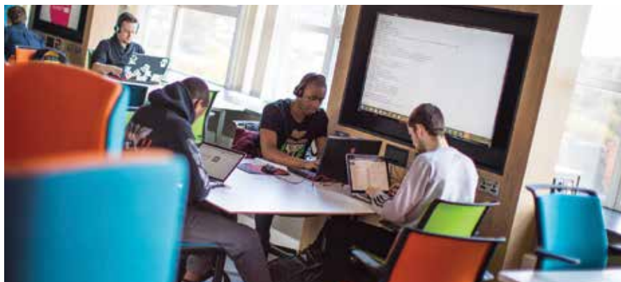
The “Digital Kiln” – Staffordshire University’s new multifunctional learning space