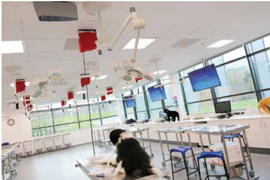
Surrey University's vet school features easy-to-use presentation systems and lighting control