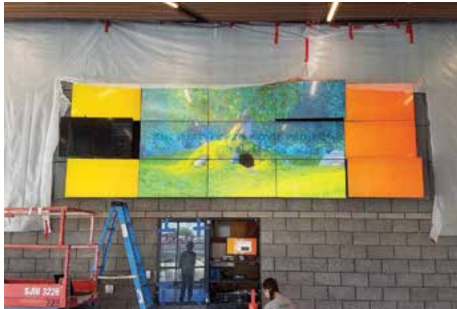
A tvONE CORIOmaster video wall being installed in a technical school

windows. We also forecast projects with key manufacturers to ensure product is available and on occasion pre-order items that have long lead times.”