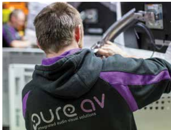
Pure AV fits lecterns for the University of Central Lancashire