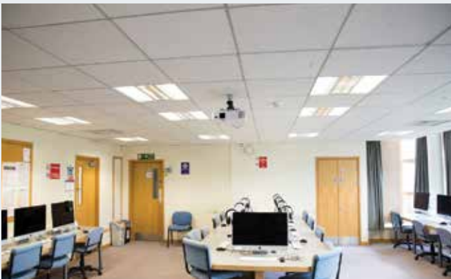
CDEC worked with Canterbury Christ Church University to upgrade and standardise teaching spaces at a rate of more than 60 a year