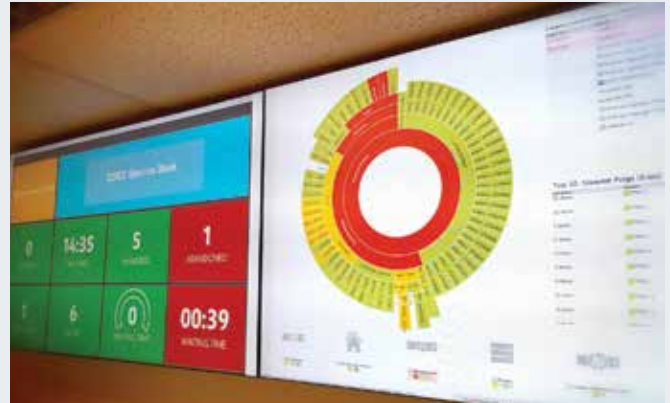
The CDEC service desk is fully compliant with the standards university IT departments expect, including ITIL, Six Sigma and SIAM