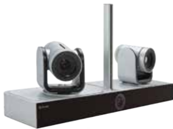
Polycom's EagleEye Director II tracks lecturers as they move around the auditorium

“There has been a huge growth in online and on-demand learning in the form of MOOCs and