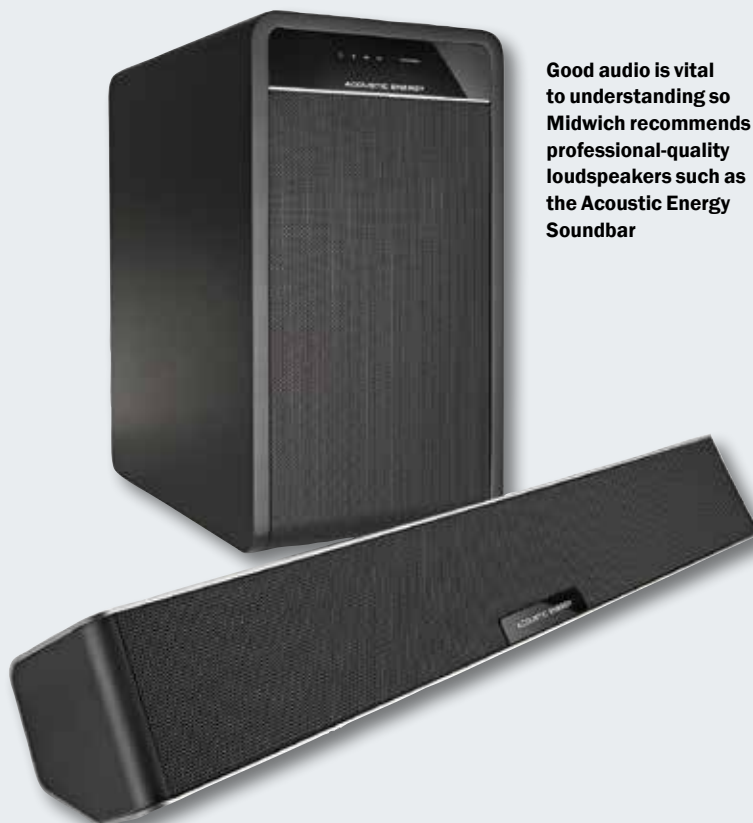
Good audio is vital to understanding so Midwich recommends professional-quality loudspeakers such as the Acoustic Energy Soundbar

“Good sound is essential to understanding and we are seeing high-quality professional loudspeakers and sound bars such as those from Acoustic Energy going into Higher Education for use in lecture theatres, to ensure clarity of sound.