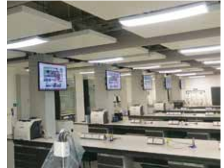
UNIVERSITY OF HERTFORDSHIRE

We started this article by asking whether HE is delivering the AV that students and their future employers want, but perhaps the real