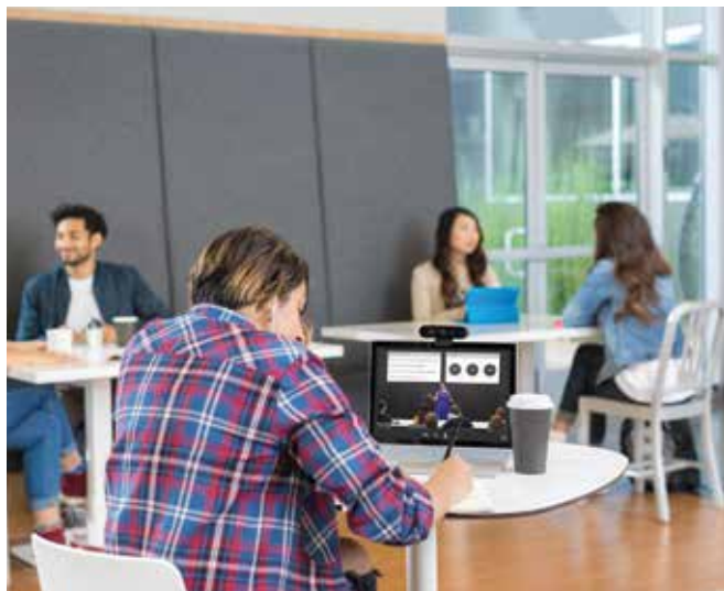
Students arrive on campus with plenty of their own technology

consideration of the need (through process, design, tech and cultural influences), then adoption will be low as the system and the space won't fulfil the requirements. Like any tool, it needs to fit the purpose."