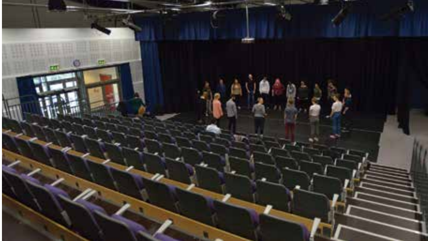
CDEC installed new projection equipment and control systems at Bolton University

learning and teaching spaces for students is reflected in the budget allocated to AV and IT provision within the university,” McLeod says. Recent major projects at the University of Dundee included the main library middle floor refurbishment. Six rooms with AV installations were provided and there were also upgrades to teaching rooms around the campus. “When we have put out tenders in the past, they have been weighted towards quality and suitability of design rather than price,” McLeod adds.