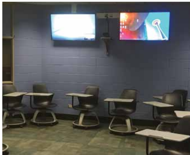
Wall-mounted display systems in use at Northeastern Illinois University

While collaboration is the most frequent