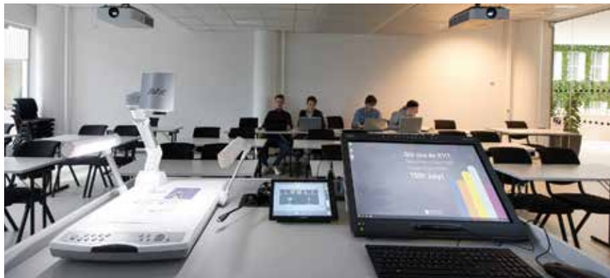
ZEEVE - NORWAY

Perhaps we shouldn’t be surprised. After all, open minds, new ideas and stretching boundaries are what higher education is all about. ■