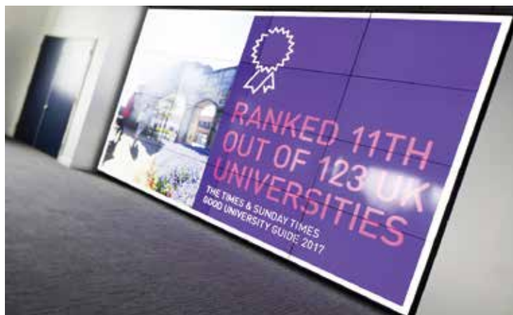
Integrator Pure AV installed this videowall for Loughborough University

Sutton. “We mitigate that by building a mix of customers in varied vertical markets, although HE still represents about 60% of our business.”