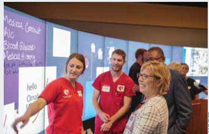
MultiTaction systems are being used in several vertical markets, but in many ways higher education is its natural home

Australia and Technische Universität Dresden in Europe.