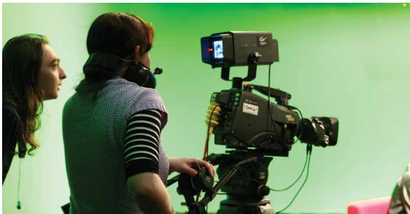
Running line checks prior to a multi-camera broadcast