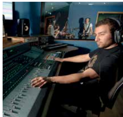
Buckinghamshire New University facilities

"Network security will have a bigger influence over AV product selection and purchasing decisions." Jonathan Owen, Warwick Uni