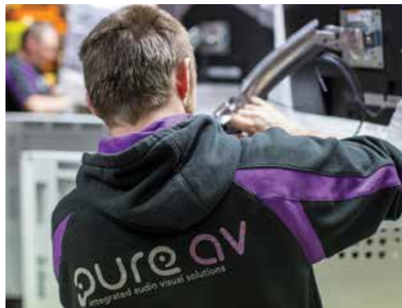
Pure AV fits lecterns for the University of Central Lancashire