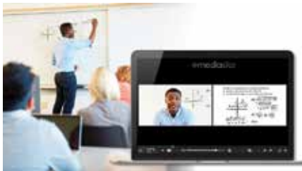
Mediasite enables automated and integrated lecture capture and multimedia management