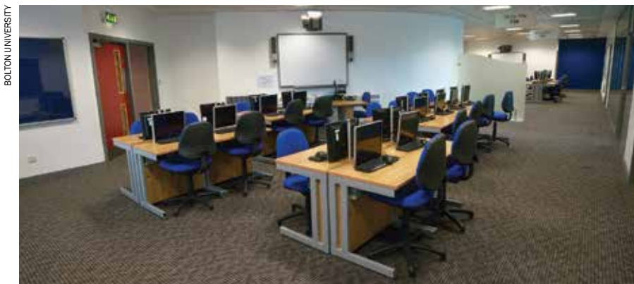
A study area at Bolton University: students increasingly expect interactive learning spaces