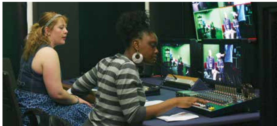
Setting up a multi-camera broadcast before adding virtual studio backgrounds

Microsoft Surface and Google Jamboard, but what's next? And how will it change the AV market?" he adds.