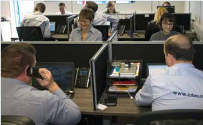
Industry first: CDEC provides a fully managed AV service – every device on the network can be monitored and updated over that network