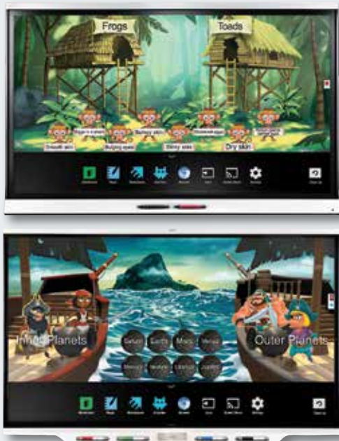
Content can easily be shared from students' own devices with the Smart Board 6000 and 7000 series to provide an engaging and collaborative learning experience