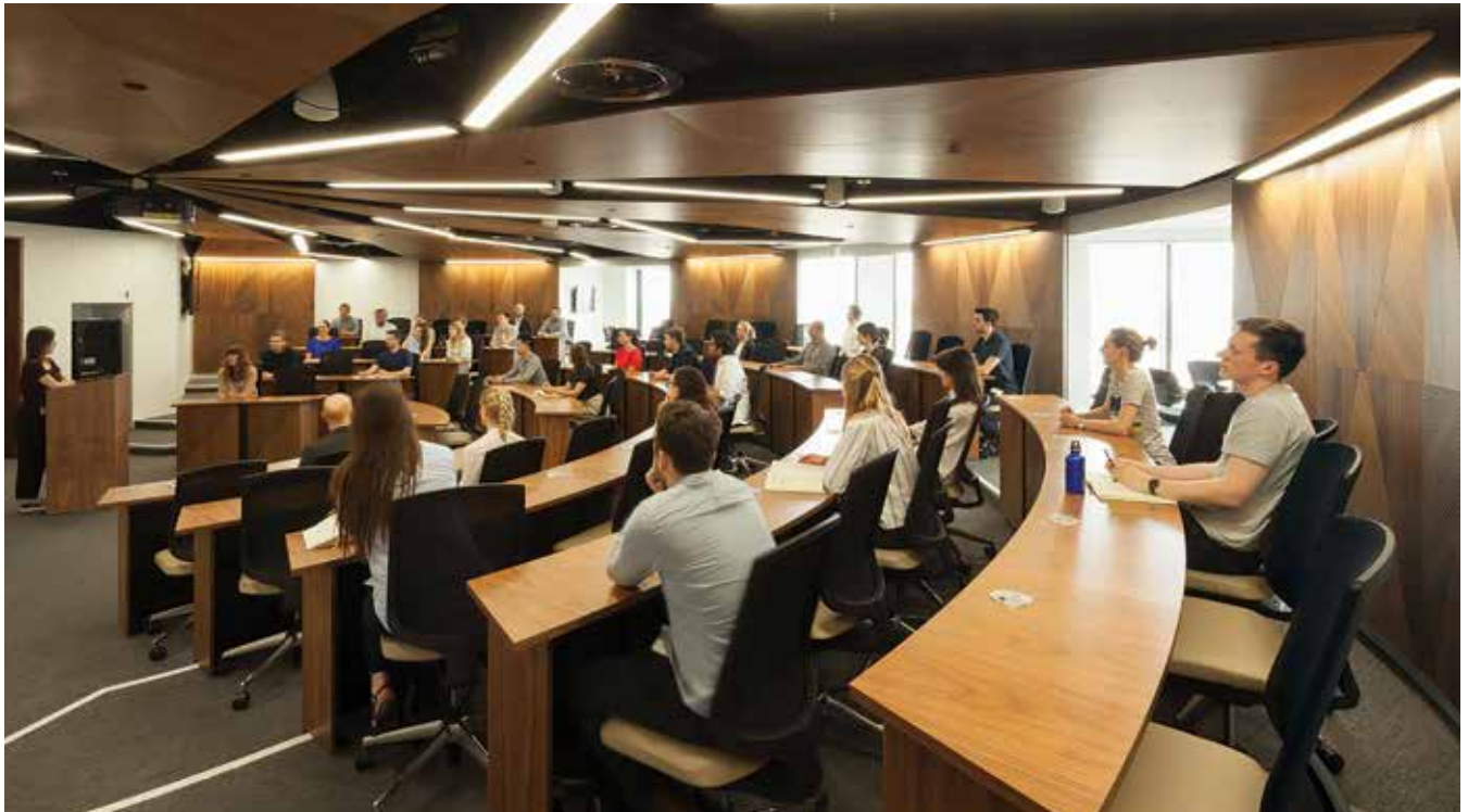
For the huge investment undergraduates are making in their education, they quite reasonably expect state-of-the-art learning environments

Network and security issues can restrict or preclude the use of technologies such as webcams, wireless devices and BYOD. Campus licensing issues can also have an impact on the use of BYOD. This is a big issue as universities move towards cloud-based collaboration and BYOD, which rely on wireless and network security – it reduces flexibility. As AV and IT converge and infrastructures becomes increasingly complex, in-house teams are up-skilling to meet the challenge. Programming and an understanding of AV-over-IP process, protocol and design are two aspects they struggle most with integration. It’s not necessarily that integrators don’t have the skills, but finding a supply/design/fit-out/programme suite of skills in one integrator is difficult. ■