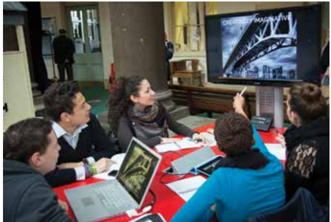
Learning zone: a group study space at the University of Derby

One way to employ sufficient manpower is to ensure that some of them are occupied in other sectors for the rest of the year. “I think if your business model becomes too HE-centric you risk the integrity of the company,” says