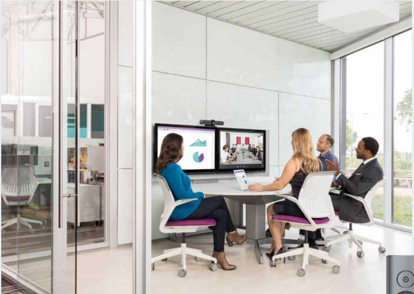
MeetUp adds professional-quality video and audio conferencing to small teaching or study rooms suitable for up to eight participants

work, the ConferenceCam range caters for most room sizes. Vandermate highlights MeetUp for groups of up to eight participants in smaller rooms and huddle spaces – an affordable option at £999.