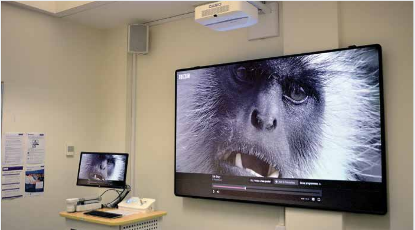
Ultra Short Throw projection solved visibility problems caused by undersized flat panels for University of Manchester's multi-purpose study rooms

these demands, Casio has included a centrally positioned lens and a lens shift.