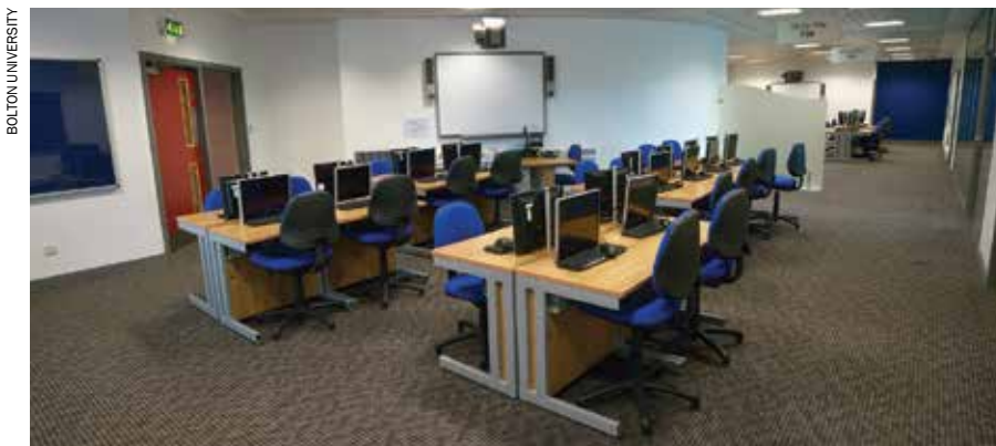
A study area at Bolton University: students increasingly expect interactive learning spaces