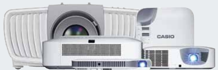
The 4K laser XJ-L8300HN joins Casio's fully lamp-free projector line-up

The study also reported 71% as likely to consider 4K lamp-free projection in the next 24-months. It's seen as contributing to a rich, collaborative learning experience for students, with higher levels of engagement and retention, so it's no surprise 80% see 4K as the projector standard for the foreseeable future. ■