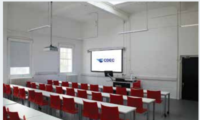
Six standard area types were defined when CDEC handled the supply and installation of AV systems across the Goldsmiths campus

G-Suite. An AV managed service is what universities need – it makes sense. We can provide a higher-quality and more affordable service.”