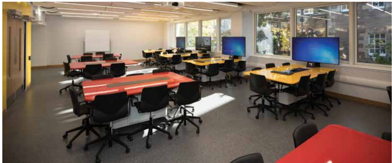
The University of Dundee recently upgraded to teaching rooms around the campus, and the installation of six rooms with AV technology

“The importance of providing high-quality