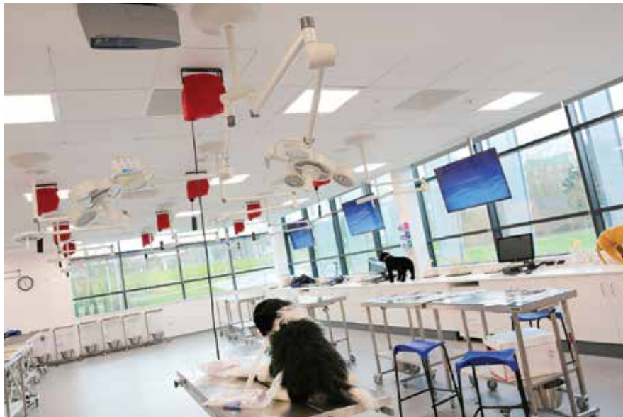
Surrey University's vet school features easy-to-use presentation systems and lighting control