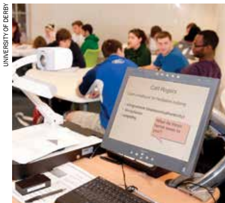
Collaborative learning: the University of Derby

Different educational needs may simply require different technologies, of course. “For example, a university may use more video conferencing to bring in professors and researchers from another campus, whereas a