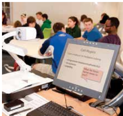
Collaborative learning: the University of Derby